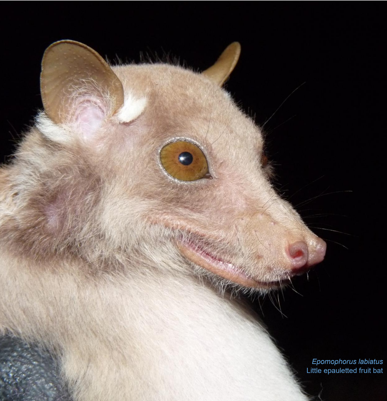
Epomophorus labiatus Little epauletted fruit bat