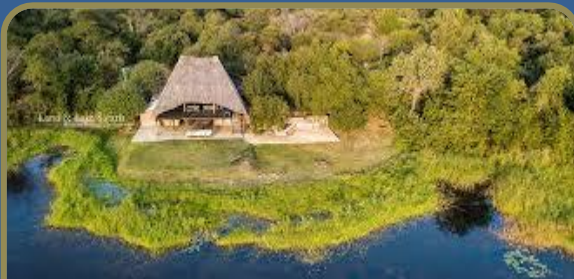
Kutu Wildlife Reserve & surrounding areas

ABC conducts research and conservation from two research camps and conducts satellite camps around the country at certain times of year depending on our projects: