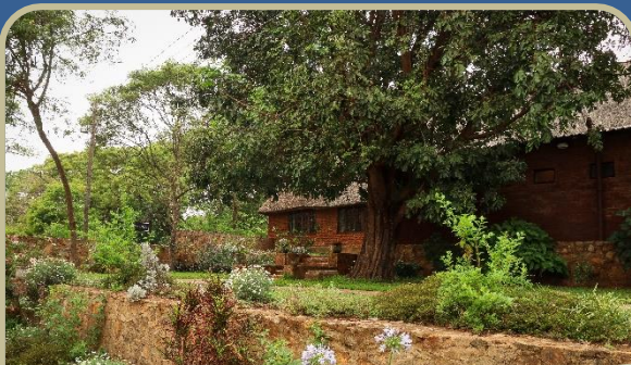
Urban Research Centre Lilongwe